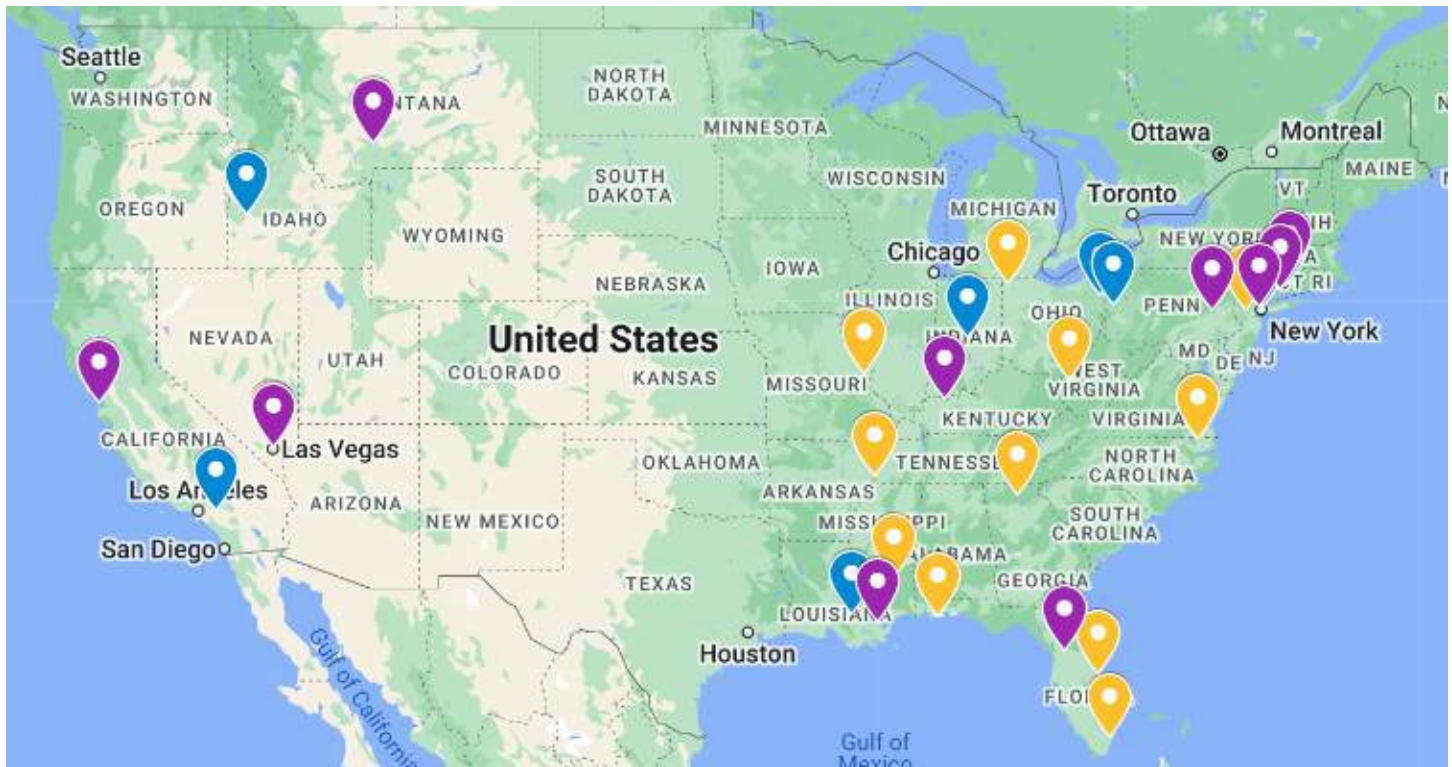
Map of reported bus fires including school bus.

If this many school bus fires happened in just 9 weeks—imagine how many will happen in the current school year.